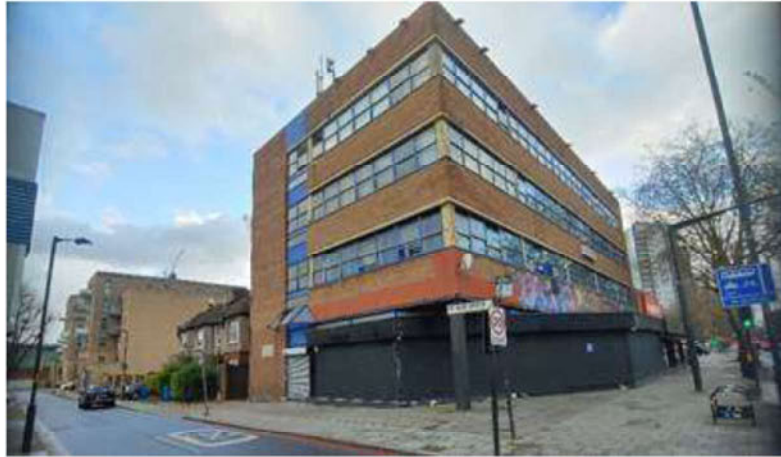
Figure 1 Empire Lounge Next to Residential Buildings of Sylvan Grove

In respect of Licensing Act 2003 Southwark Statement of Licensing Policy 2021 – 2026 , licensing policy hours for a residential area, require restaurant premises close at 23:00 daily, stated under SECTION SEVEN – HOURS OF OPERATION . The application to re-permit and extend the current provisions approved in 2021 for the sale and supply of alcohol beyond 23:00, which is the usual limit for residential areas and the current granted 01:30, would therefore not be appropriate.